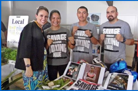
Savage House Boxing Team with PM Jacinda Ardern.